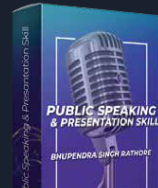
PUBLIC SPEAKING & PRESENTATION SKILL