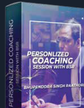
PERSONALIZED COACHING SESSION WITH BSR