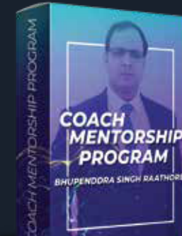
COACH MENTORSHIP PROGRAM