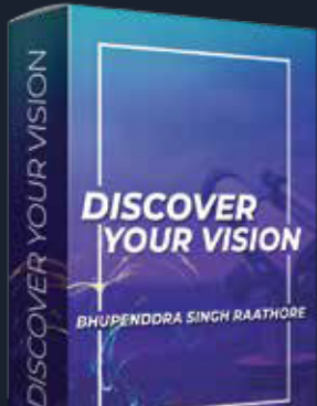
DISCOVER YOUR VISION